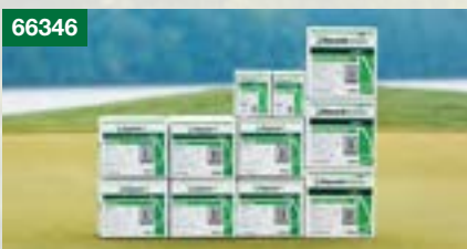
Greens Foundation Solution