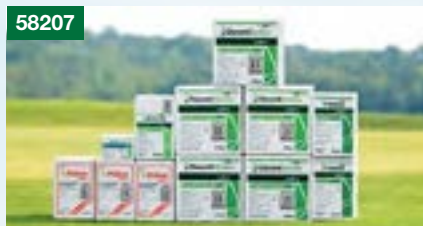
All Season Solution