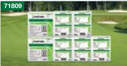
Contend Winter Solution