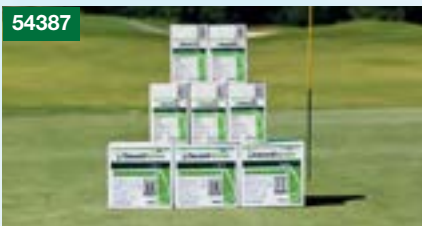
A 2 Z Solution

Commitment Period: In order to be eligible for the prices and terms for the products described in this Pallet Offer, golf courses and professional applicators must commit to purchasing any of the Golf Pallets described below from a Syngenta Authorized Agent/Retailer between October 1, 2022 and December 8, 2022