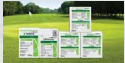
Fairy Ring Solution