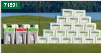
Fairway Starter Solution