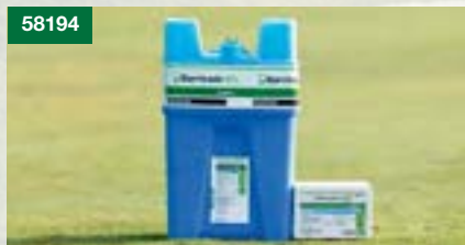
Warm Season Herbicide Solution