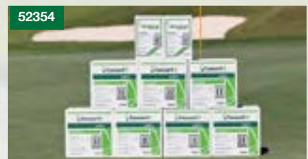
Snow Mold Solution