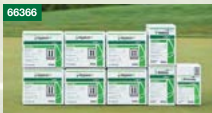
Greens Protection Solution